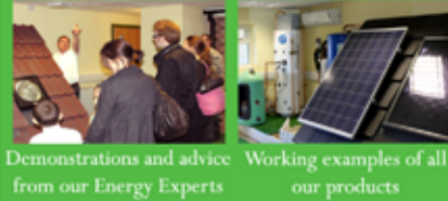
Demonstrations and advice from our Energy Experts | Working examples of all our products

0500 127 005 www.theenergycentreyork.co.uk or text '2EARN' to 88802