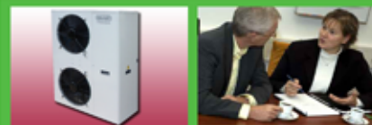
Bespoke systems with quality materials | Realistic advice about the return on your investment

A utumn is my favourite time of year. As soon as the air feels crisp and the whiff of coal and wood smoke permeates the village streets, I know it's time to pull out the woolly jumpers from storage.